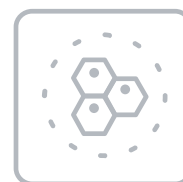
Stimulates new cells